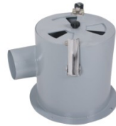
Hot Air Recycling Device