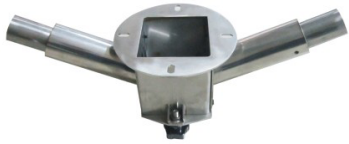
Double Tube Suction Box